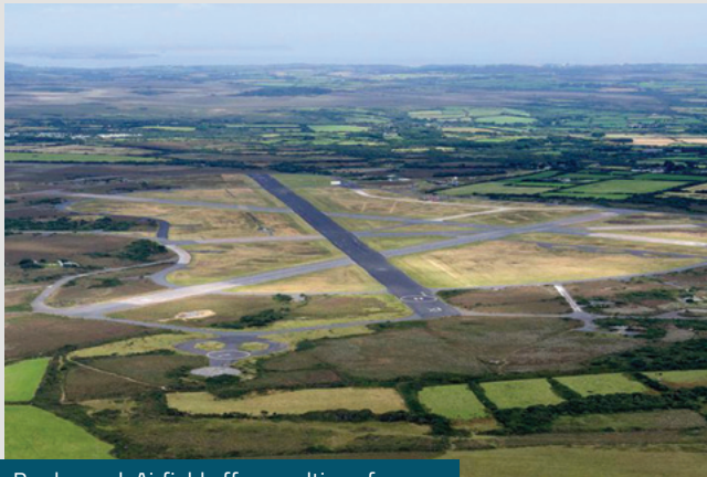
Predannack Airfield offers multi-surface options from grass to concrete and tarmac.

WholeShip's Lizard Range is one of Europe's largest air ranges capable of testing autonomous air systems Beyond Visual Line Of Sight (BVLOS).